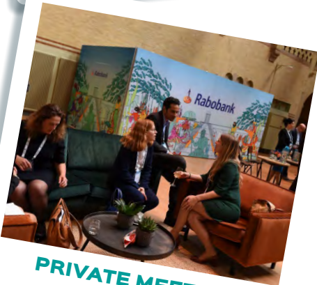
PRIVATE MEETING ROOMS