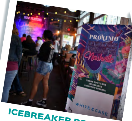
ICEBREAKER DRINKS RECEPTION