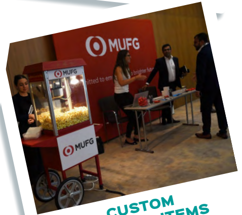
CUSTOM BRANDED ITEMS